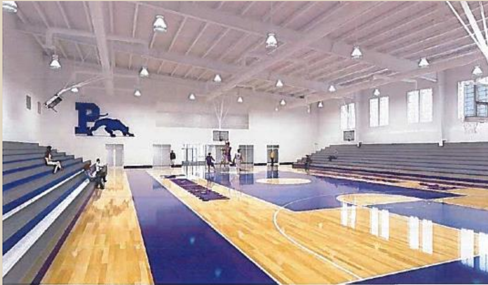
EARLY CONCEPTUAL RENDERING